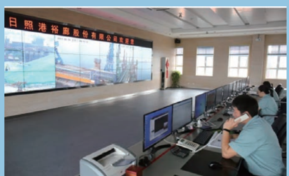
遠程無死角監控 Remote comprehensive monitoring