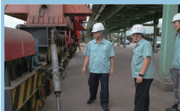
現場安全檢查 On-site safety inspection